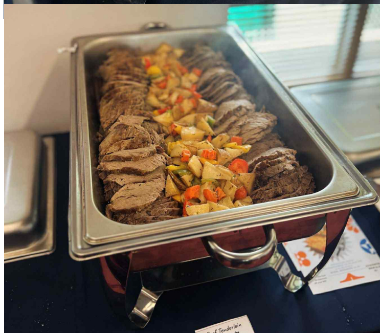
1. Beef tenderloin Slices (Brazilian beef standard or other high quality beef) --- $800MOP / $500MOP