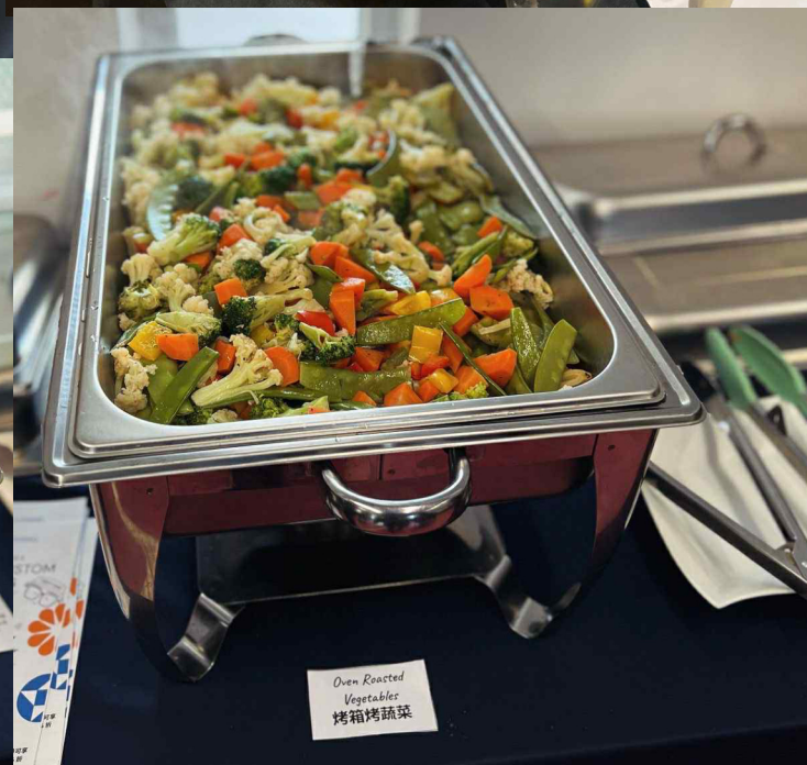
5. Mixed Grilled Vegetables --- $500 MOP / $300MOP